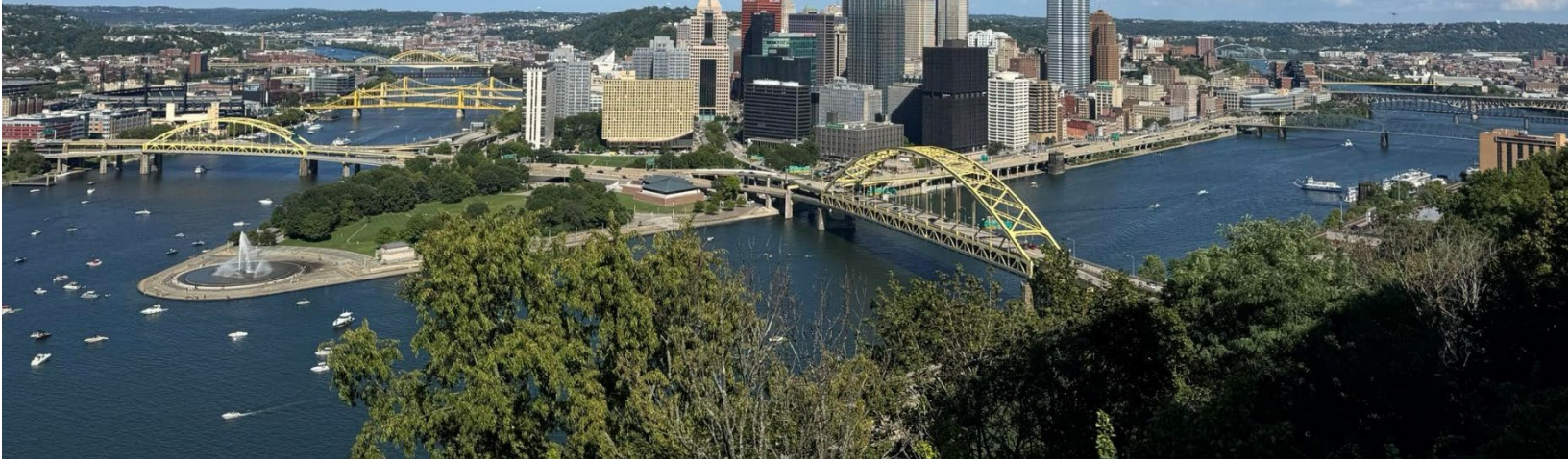
ABOVE, THE POINT - WHERE THREE RIVERS MEET